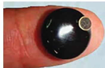
Bug invisible transmitter